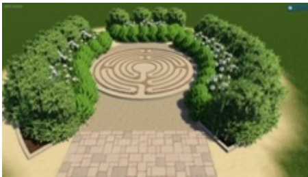
24' Walking Labyrinth w/ Brick Border

Partner with us and join our “Help us Grow our Garden” Campaign Show your support and Donate your brick today!