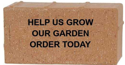
4" x 8" Personalized Brick - Cost: $100